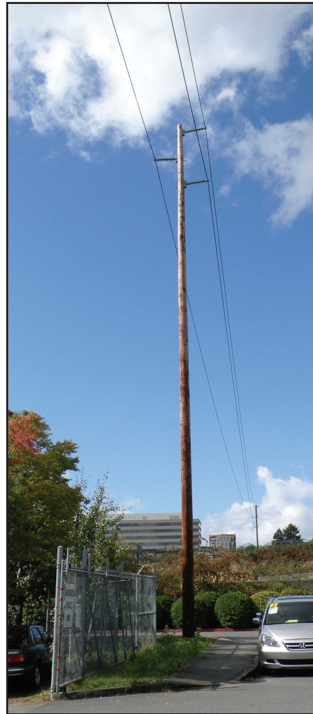
Single-circuit 115 kV wood pole with alternating insulator placement