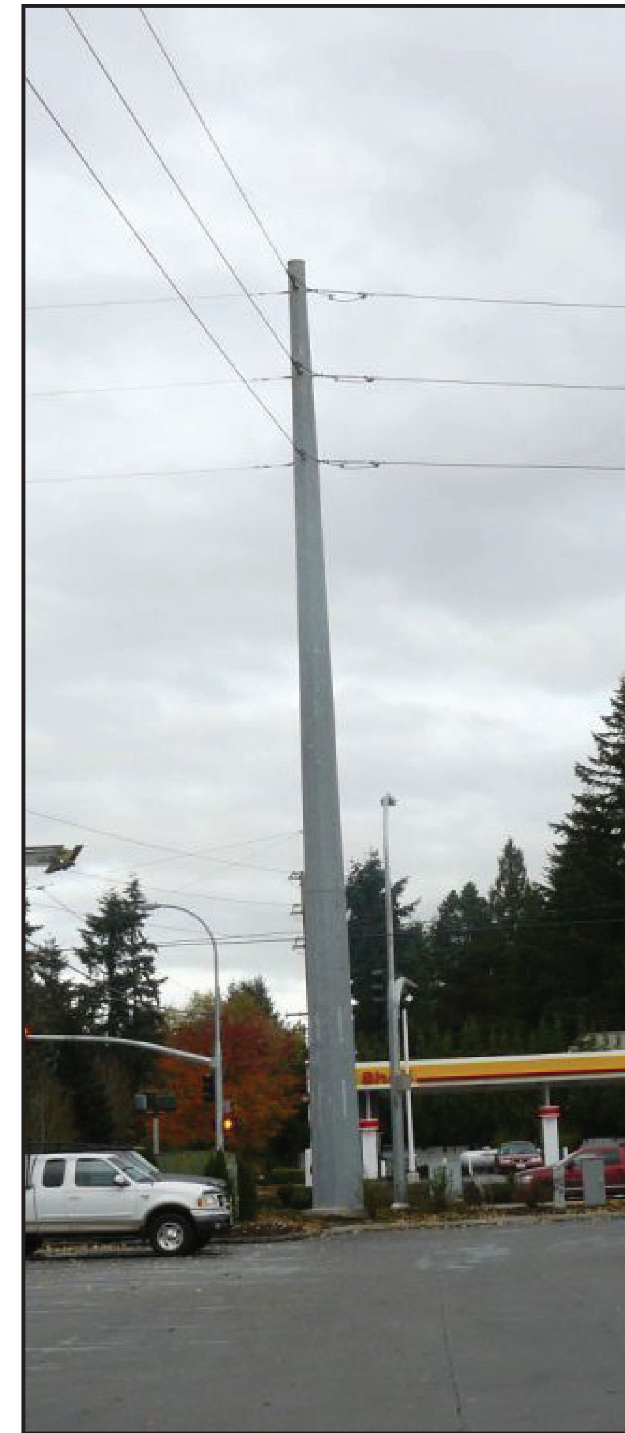
Single-circuit 115 kV steel pole