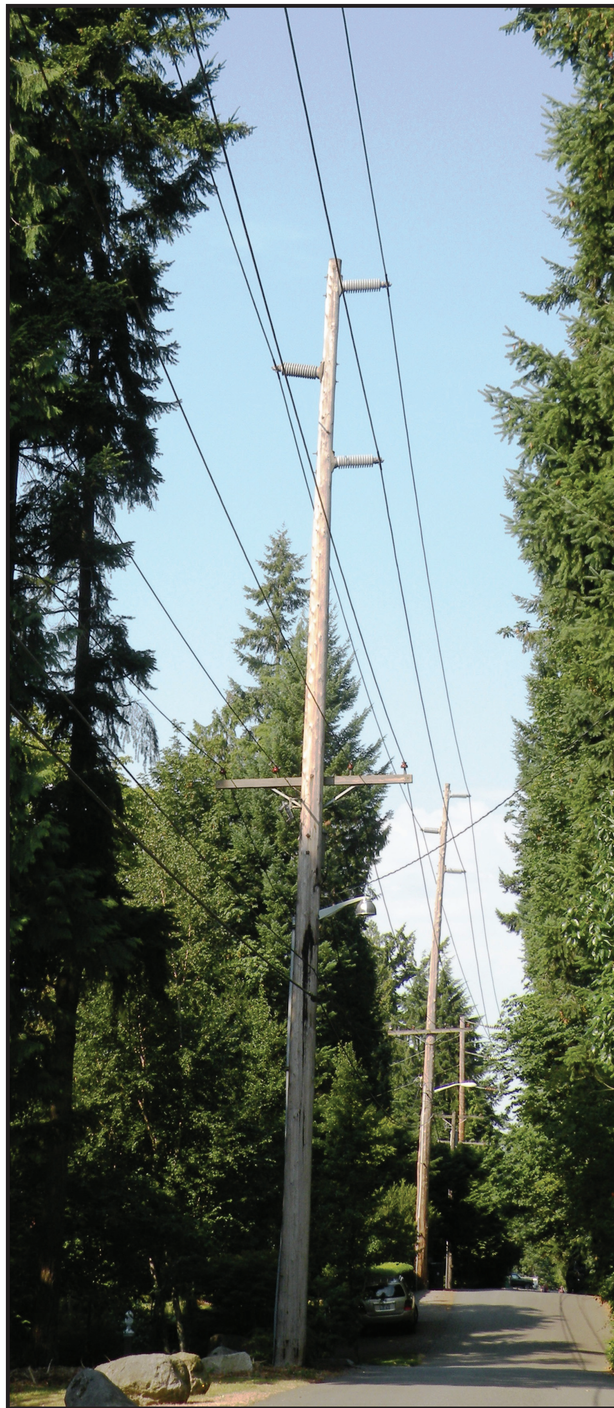
Single-circuit 115 kV wood pole with distribution underbuild