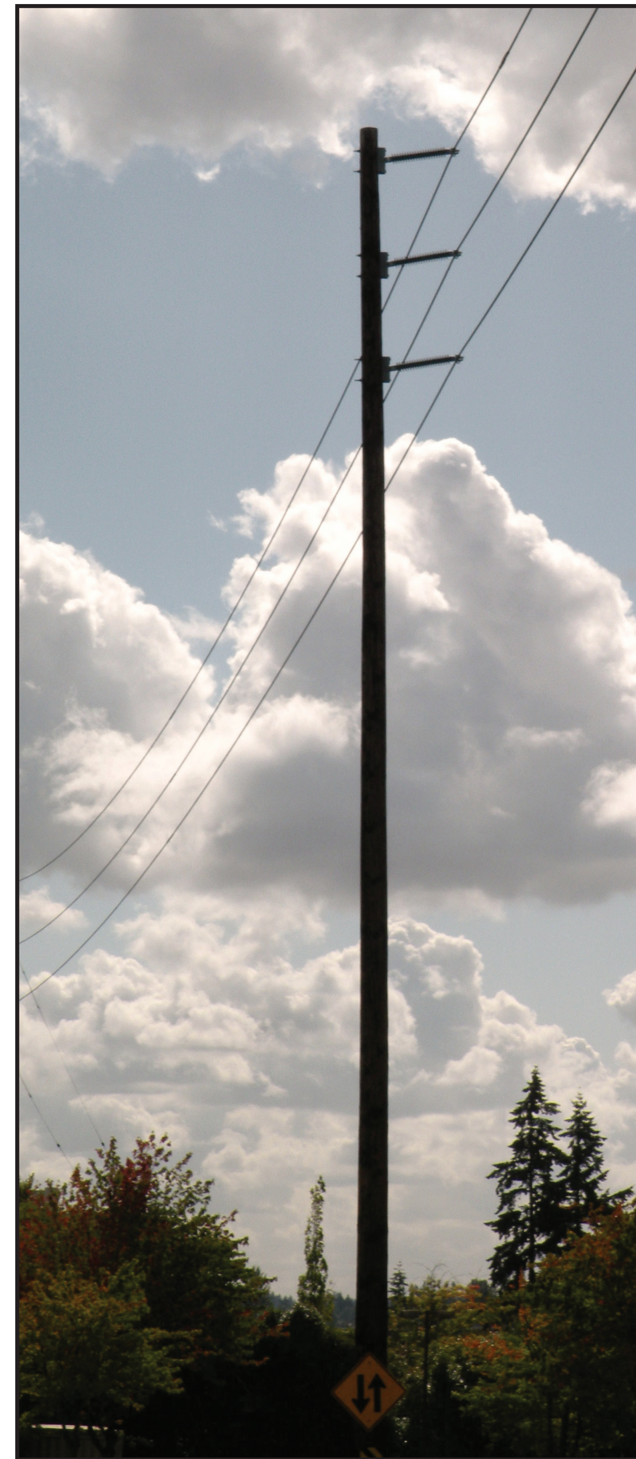
Single-circuit 115 kV wood pole with insulators on one side